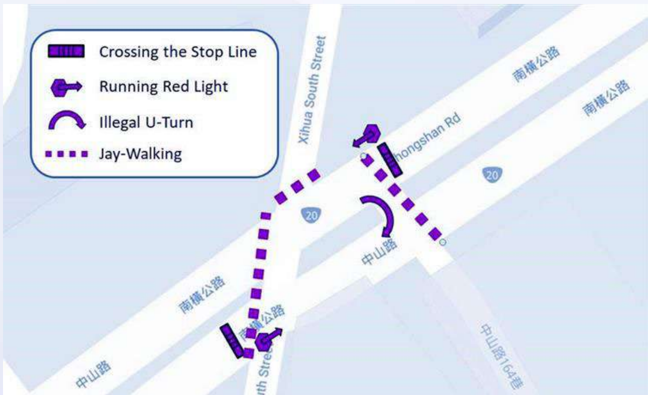
Figure 2 – Common Infractions at ZhongShan–West HuaNan Intersection in Tainan