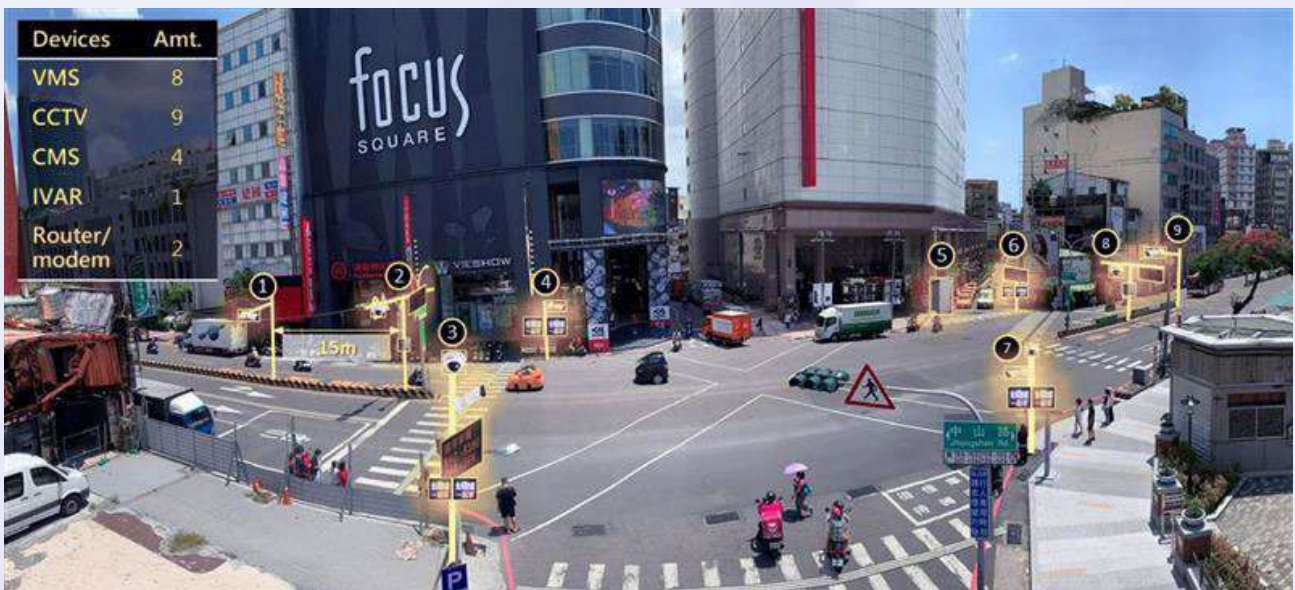
Figure 6 – Placement of Smart Solution Equipment at ZhongShan–West HuaNan Intersection

Two cameras were used at each red light—one to detect the vehicle type and its infraction, the other to recognize the license plate. The event data would be processed in Gorilla’s on-site IVAR machine and then sent back to central command for further analysis.