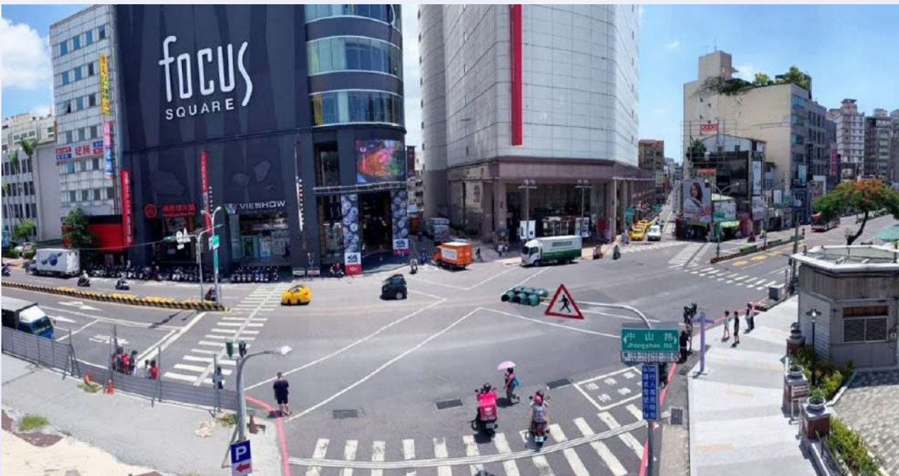
Figure 1 – Tainan City in Taiwan has several converging and complex intersections

Tainan City in southern Taiwan handles over 1 million vehicles on its streets every day. 1 Pedestrians navigating the city have to deal with unsafe intersections and frequent drivers flouting traffic laws. The Tainan City Government was looking for a way to manage its busiest intersection, ZhongShan–West HuaNan Roads, and make it safer for all users.