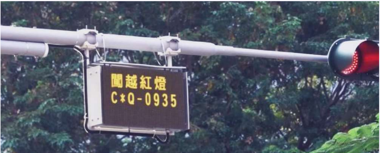
Figure 7 – CMS Digital Signs produced real-time warnings to violating motorists

For example, if a motorcyclist is caught making an illegal turn, then the smart intersection system would detect the event and relay the motorist's license plate number to the CMS sign, so that the driver could see they've been recorded and hopefully curb their own behavior.