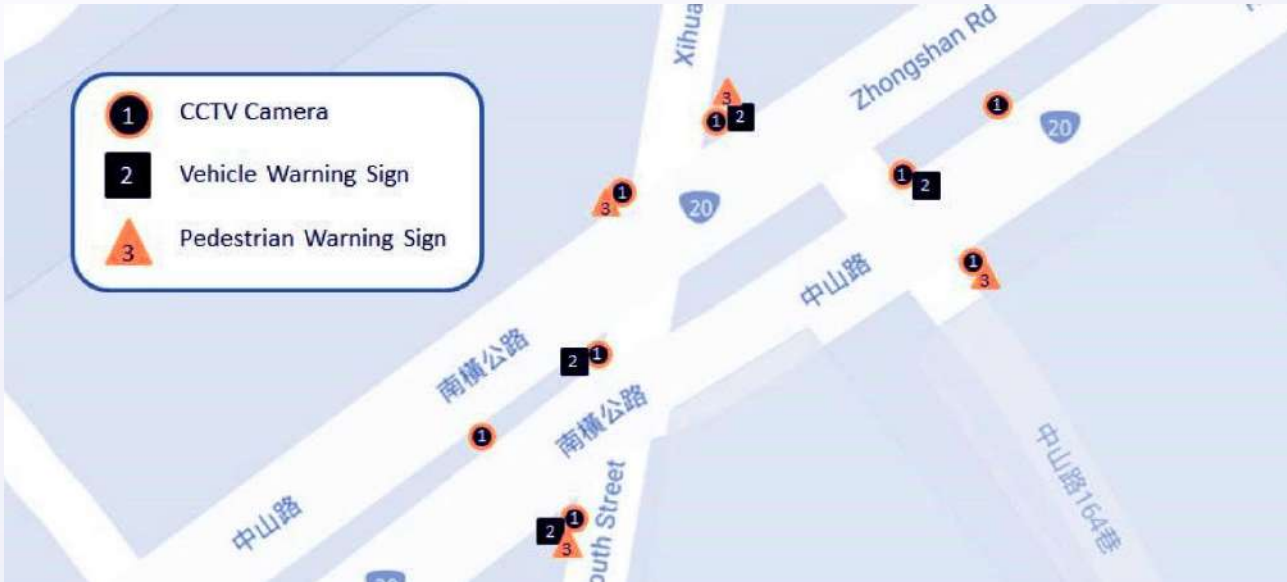
Figure 4 – Placement of Smart Solution Equipment at ZhongShan–West HuaNan Intersection

This gave Gorilla technicians the data needed to figure out where best to deploy the smart intersection components.